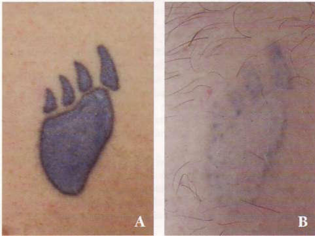
Figure 3. Blue-green tattoo located on the back of an 18-year-old man (patient 3) before (A) and after 3 treatments with the Sinon Q-switched ruby laser administered at 4- to 8-week intervals (B).

between each session (Figure 3B). A 5-mm spot size and an initial fluence of 3 J/cm 2 , which was increased to 5 J/cm 2 over the course of treatment, were used. The patient experienced no treatment-related adverse events.