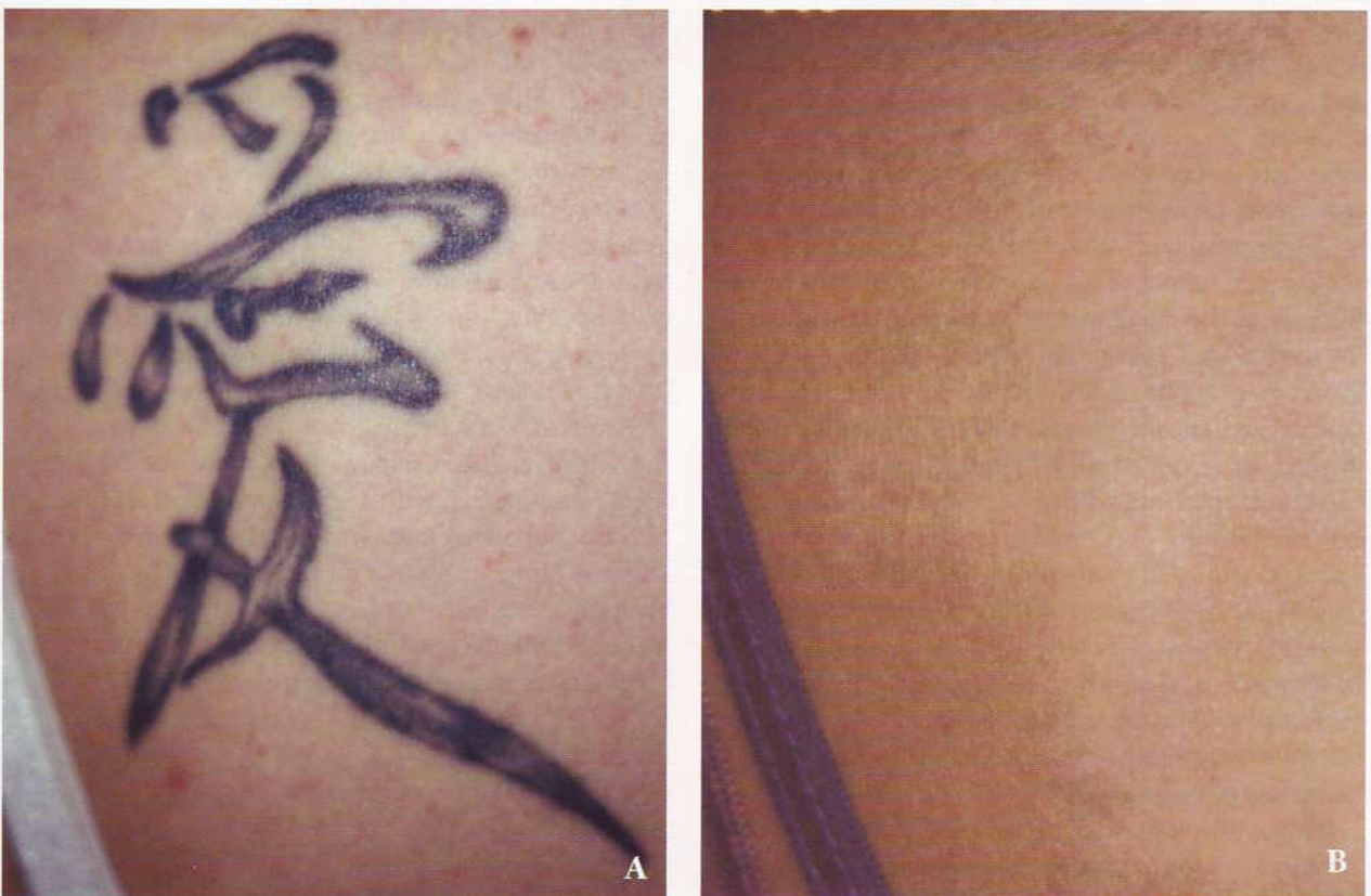
Figure 2. Patient 2 before (A) and after 8 treatments with the Sinon Q-switched ruby laser (B).

An 18-year-old man with Fitzpatrick skin type II presented with a blue-green tattoo on his back (Figure 3A). The patient underwent 3 treatments with the Sinon Q-switched ruby laser with intervals of 4 to 8 weeks