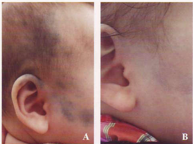
Figure 4. An 18-month-old girl with an extensive nevus of Ota (patient 4) before (A) and after 3 treatments with the Sinon Q-switched ruby laser administered over a 9-month period (B).

The Sinon offers several advantages over previous Q-switched ruby lasers—a divergent beam and fluences ranging from 2 J/cm 2 to 30 J/cm 2 , and, at 73 kg (approximately 160 lb), it is at least half the weight of its predecessors. The results achieved in our practices are comparable to those reported in the literature; however, the new design makes this device easier to use than previous models, and because it does not require water cooling, it may be more cost-effective. Moreover, it has